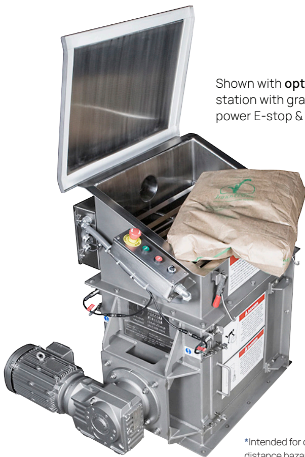
Shown with optional hand-add station with grating, and optional power E-stop & PB station.*